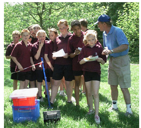
Above: Blatch students go orienteering