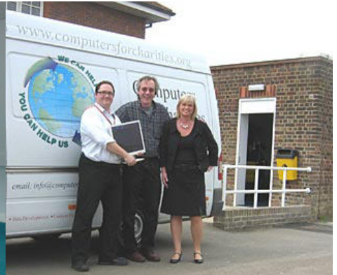
Computers for Charities collect broken and unusable IT equipment from Network Services to be refurbished for schools in Eastern Europe and Africa.