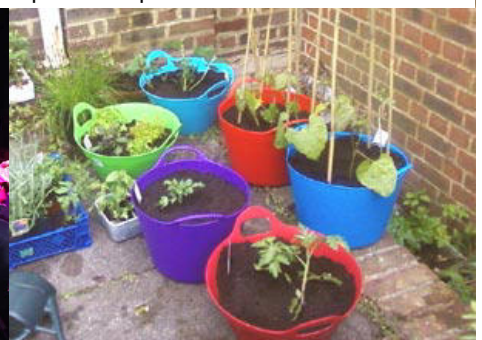
Eco Club's fruit, veg and herb garden