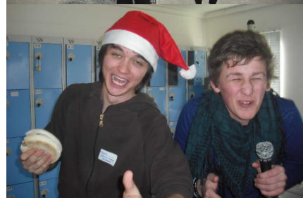
Sixth Formers go all out for RAG week