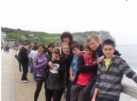
Interreg Trip to Paris