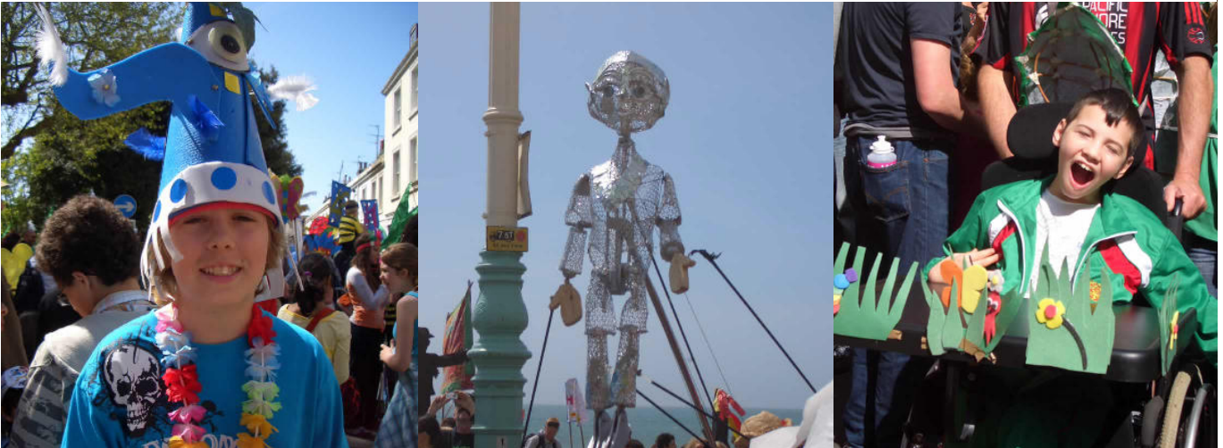
Above: Blatch students take part in the Children's Parade on Medeira Drive

Visit the School Galleries on the Portal for lots more photos