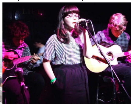
Teenspirit 2009 at Concorde2