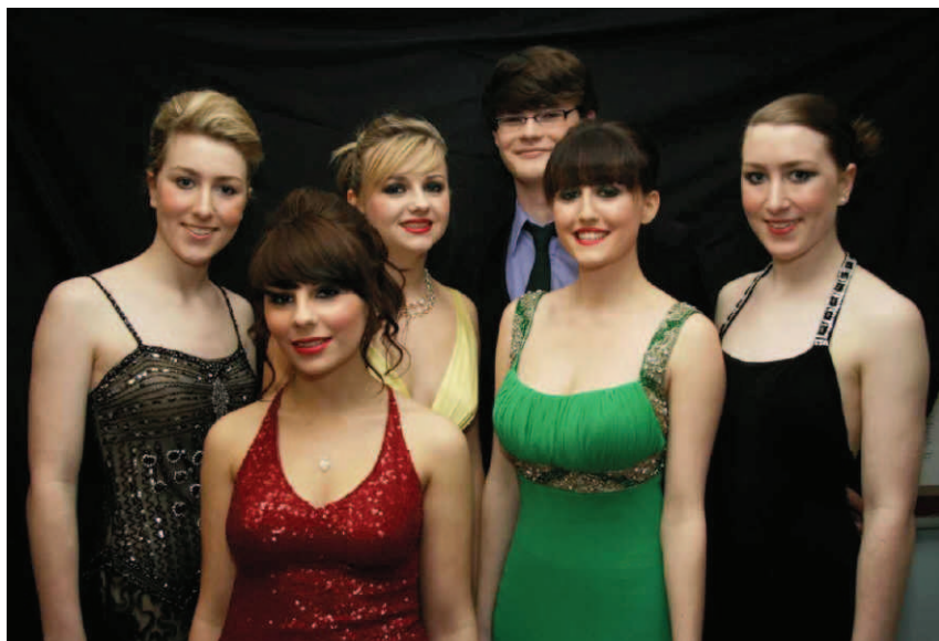
Model students at the Fashion Show 2009