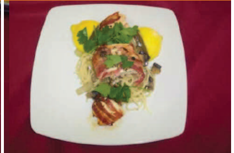
Joshua Winstone; Garlic Chicken wrapped in Pancetta with Mushroom & Onion Spaghetti