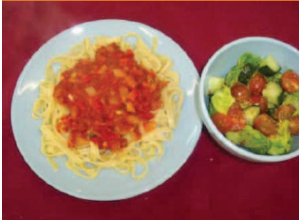
Jenny Goodsell: Chicken & Bacon Meatballs in tomato sauce, Mixed Salad with Mustard Dressing