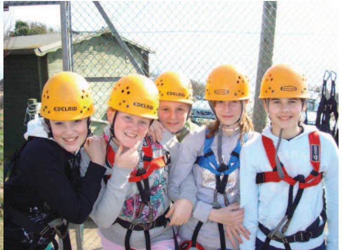
Above: Y8 Students making the most of the Dorset sunshine