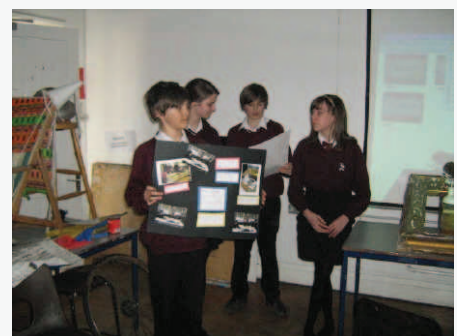
Year 8s demonstrate their installations