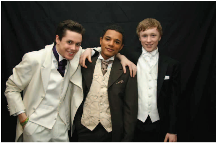
See the full gallery of Fashion Show photos on the BMS Portal